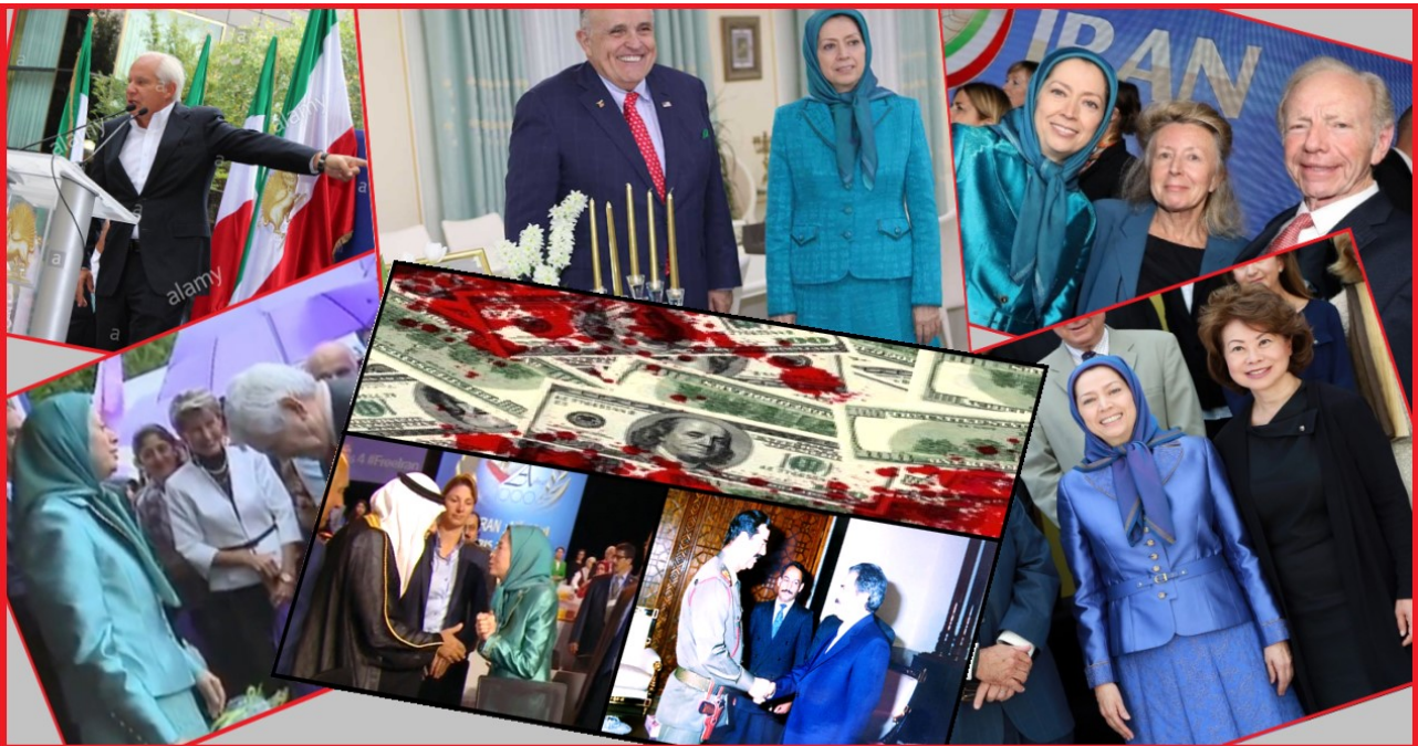
Former Senator Joe Lieberman, Former Speaker of the House Newt Gingrich, Former New Jersey Senator Robert Toricelli, Elaine Chao, and many other desperate Former US officials queue to praise the Former Saddam's Private Army Leader Maryam Rajavi (now deported to Albania). Saudi Money Talks?